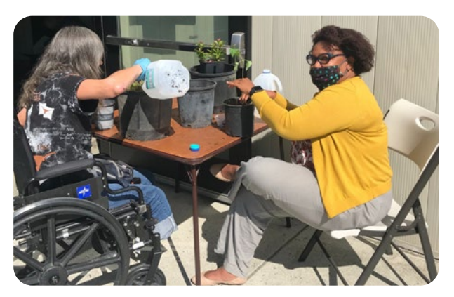
ABOVE: Your support allows BFS staff to work one on one with guests and care for all aspects of their wellbeing.

she is done. The Caring Clinic fills her prescriptions and helps her manage her medication at the shelter, and BFS staff help her keep up with her physical, occupational, and speech therapy.