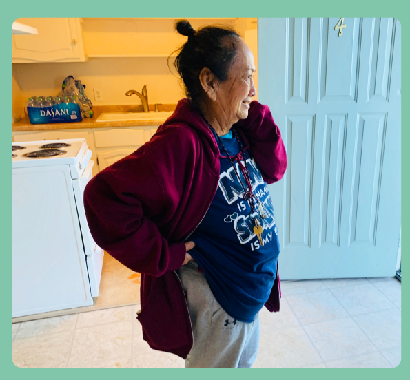
PICTURE ABOVE » Previous Brother Francis Shelter guest taking in her new apartment on move in day.

It is a space for guests to heal, connect with nature, and learn to care for the garden.