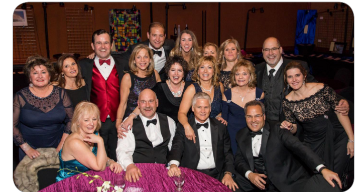
Supporters and staff had a great evening