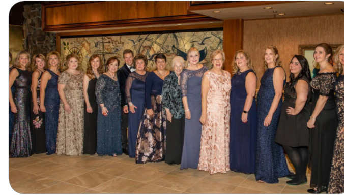
Members of the Charity Ball Committee