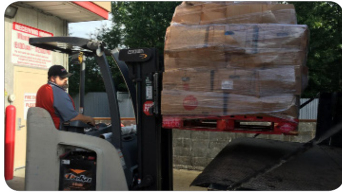
PICTURE ABOVE » A Costco employee loads more than 2000 pounds of chicken for St. Francis House.

COSTCO DONATES MEAT TO ST. FRANCIS HOUSE