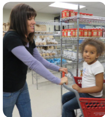
PICTURE ABOVE » Families can shop once monthly for a several-day supply of food at St. Francis House.

September is Hunger Action Month. Join the effort: donate, host a food drive, or volunteer. Visit cssalaska.org to learn more.