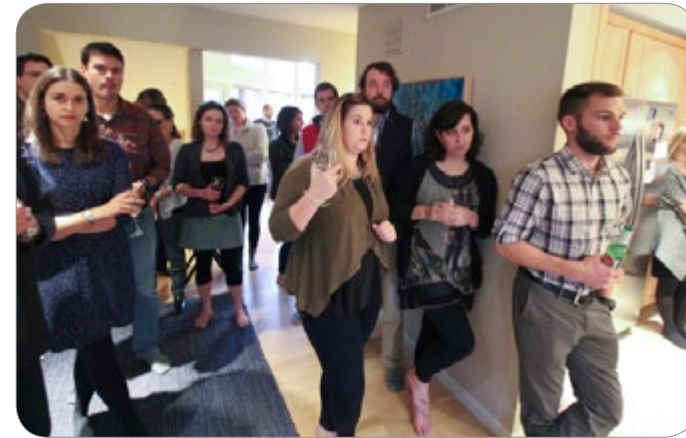
PICTURE ABOVE » Brother Francis Shelter supporters listen and ask questions in a social setting on the shelter's impact.