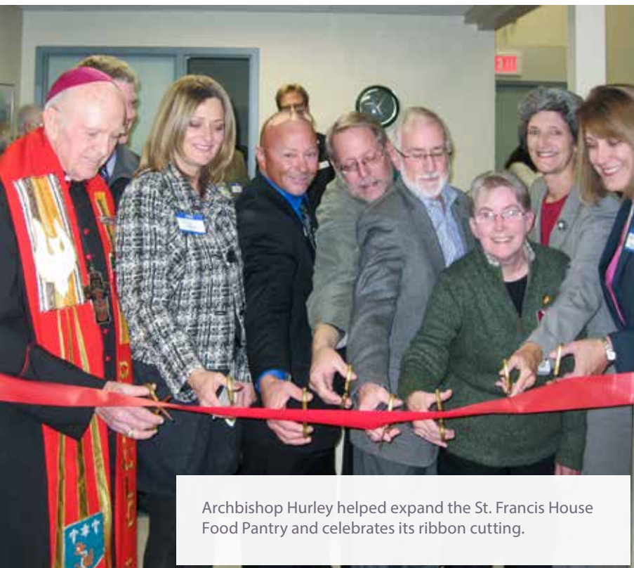
Archbishop Hurley helped expand the St. Francis House Food Pantry and celebrates its ribbon cutting.