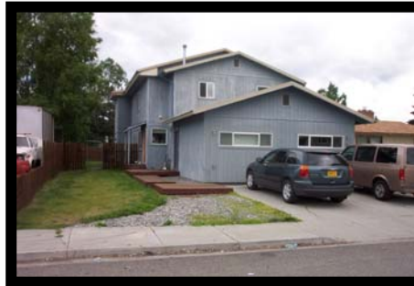
Charlie Elder House

Residents are encouraged in their studies, sports and after-school activities. The teens learn basic life and domestic skills, such as developing healthy relationships, building a strong work and social ethic, budgeting and coping successfully with the transitions and challenges that are a normal part of adolescence.